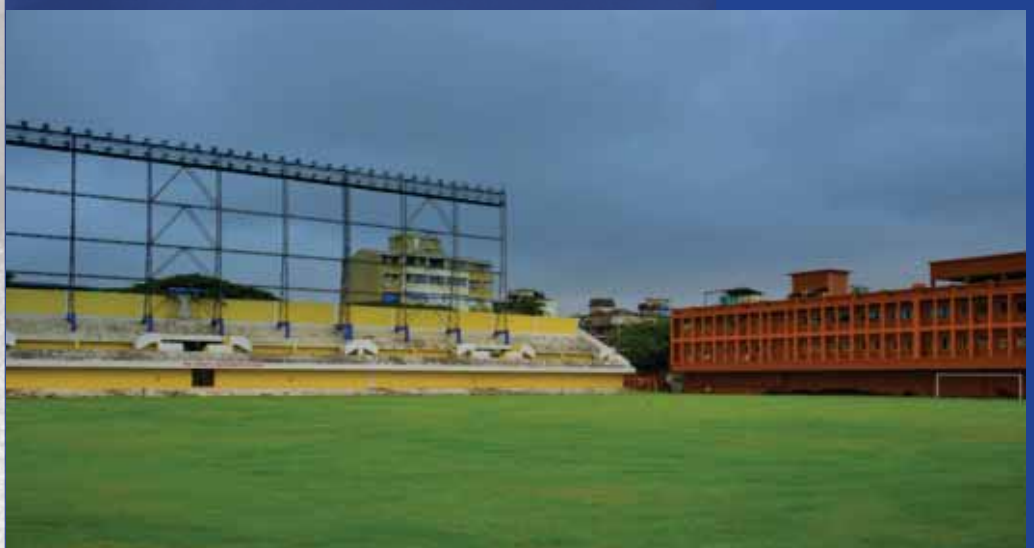
Tilak Maidan, Vasco