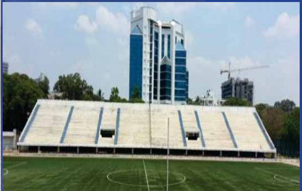
Bangaluru Football Ground, Bangalore