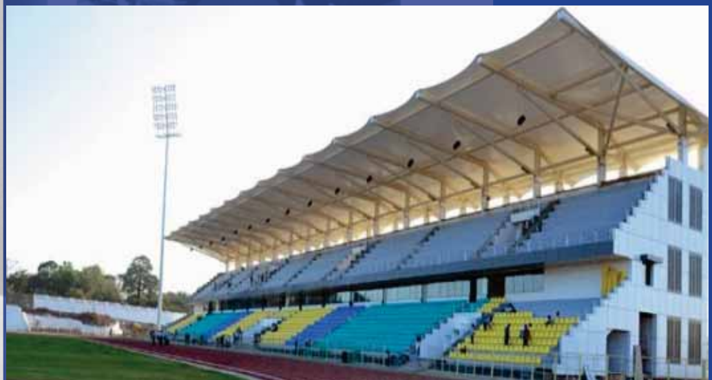
Goa Medical College Stadium, Bambolim