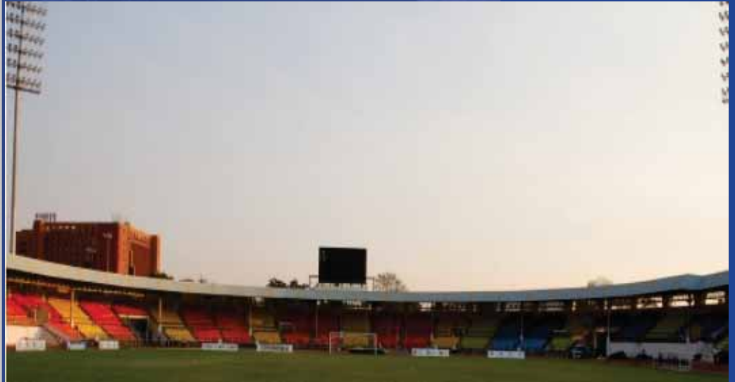
Balewadi Sports Complex, Pune