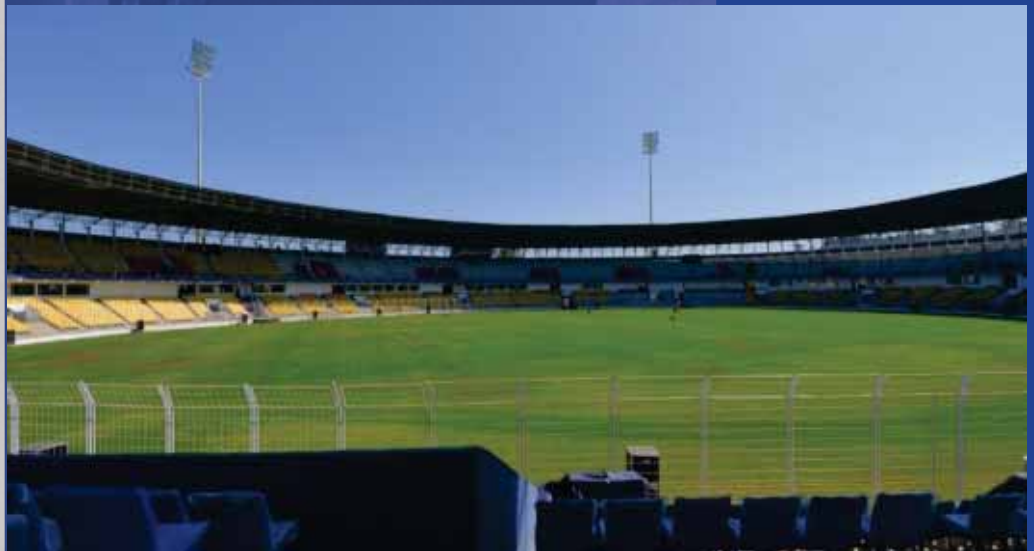
Pandit Jawaharlal Nehru Stadium, Fatorda

Pandit Jawaharlal Nehru Stadium, Fatorda Goa Medical College Stadium, Bambolim Tilak Maidan, Vasco